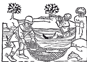
Fisheries were extremely important in the medieval fens. In 1086 Swaffham Bulbeck owed 100 eels to its lord; Bottisham owed 400.

fish and wildfowl in winter when water levels rose. With grain and heath pasture for sheep on the chalk uplands, the fen edge villages grew prosperous.